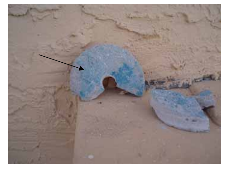
The blue coloring is the bonding agent applied to the exterior wall prior to the stucco installation.