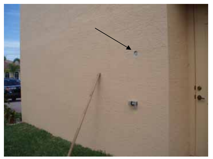
Location of the next photo at the west side of the house. Core samples were taken & the thickness of the stucco was measured at each sample.

The stucco measured 5/16" at this area. The stucco should be applied to a thickness of 5/8".