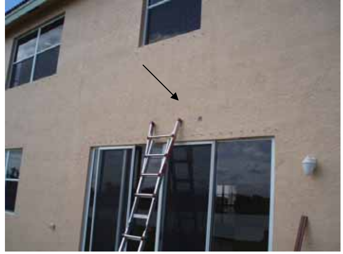
Location of the previous photos at the back of the house over the sliding glass doors.

Core samples were taken & the thickness of the stucco was measured at each sample. The thickness of the stucco was 3/8 " at this location.