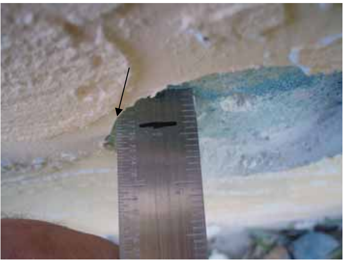
The thickness of the stucco was 3/8 " at this location.