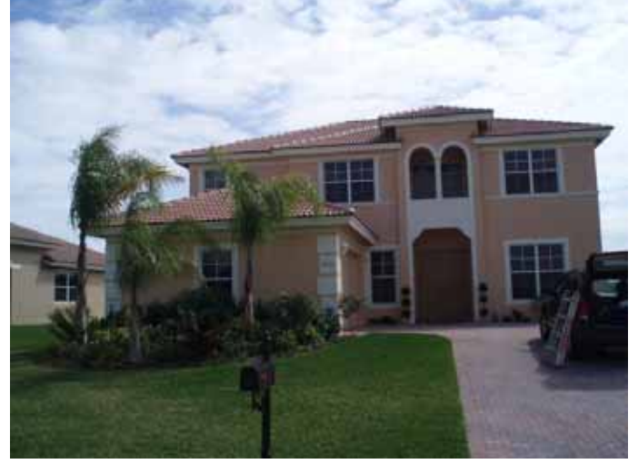
Site photo. The front of the house faces towards the north.

Stucco Inspection Report at 5065 Topaz Ln SW Vero Beach FI 32968 03.20.07