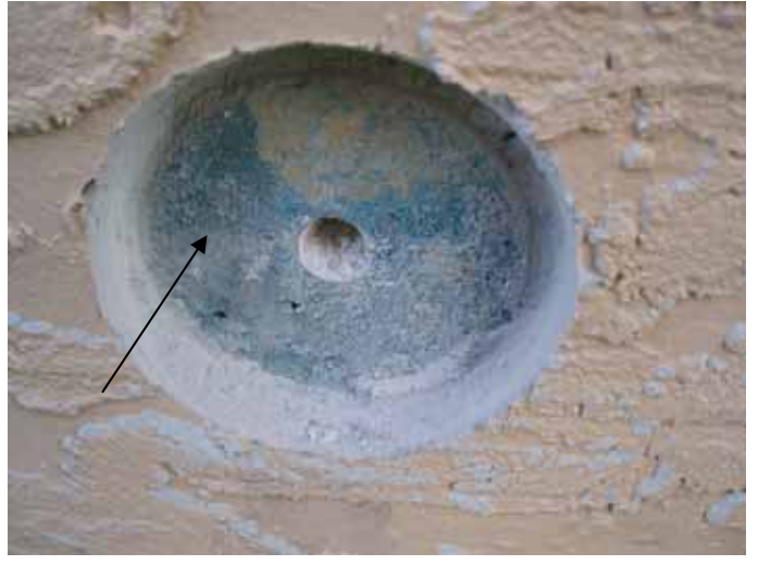
The blue coloring is the bonding agent applied to the exterior wall prior to the stucco installation.

Location of the next photos at the west side of the house.