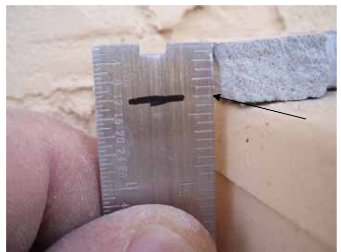
The thickness of the stucco was 3/8 ^{\circ} at this location. The stucco should be installed in compliance with ASTM C 926.