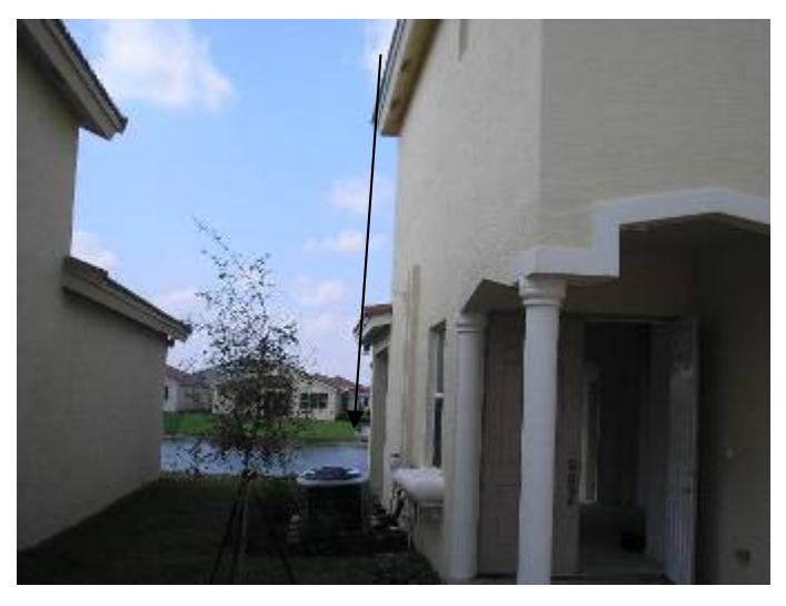
Gutters have been installed in accordance with the manufacturer's installation instructions. §M304.1

Repairs to the condensing units were completed during the 3<sup>rd</sup> inspection.