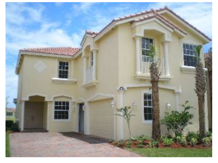
Site photo. The front of the house faces towards the east.