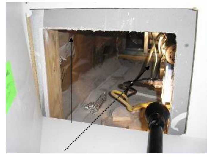
The opening in the cabinet is not big enough to allow the whirlpool tub pump motor to be accessed for service.

In regard to the whirlpool tub pump motor access the following sections from the Florida Building Code apply.